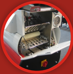
Fold Up To Eight Sheets