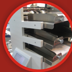
Up to five A4 Paper Trays