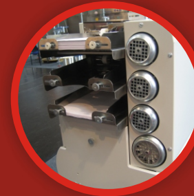
Powerful Feed Motors