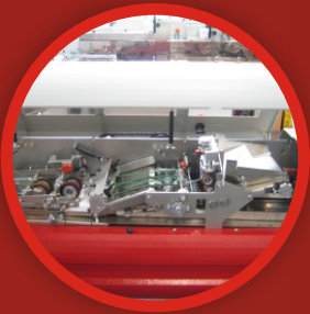
Up to 7 Insert Stations