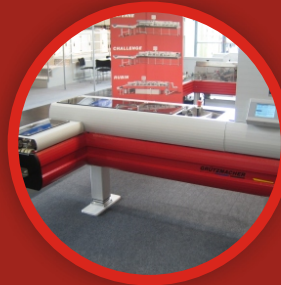
Optional Electric Stand